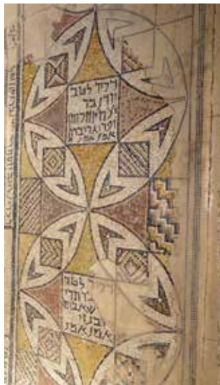
Mosaic floor design of the ancient Synagogue at Tzipori

Second Temple and post Temple-destruction periods, the most prominent city of the Galilee, a bustling metropolis and scholarly town, which during Rabbi Yehuda HaNasi’s sojourn, hosted the Sanhedrin (Rabbinic Supreme Court).