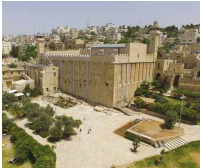
Tomb of the Patriarchs, Hebron

London 4.54pm Southend 4.50pm Leeds 4.51pm Edinburgh 4.49pm Hull 4.52pm Glasgow 4.56pm Birmingham 4.58pm Sheffield 4.57pm Manchester 4.57pm Liverpool 5.00pm Southport 5.03pm Cardiff 5.10pm Dublin 5.12pm Jerusalem 5.25pm