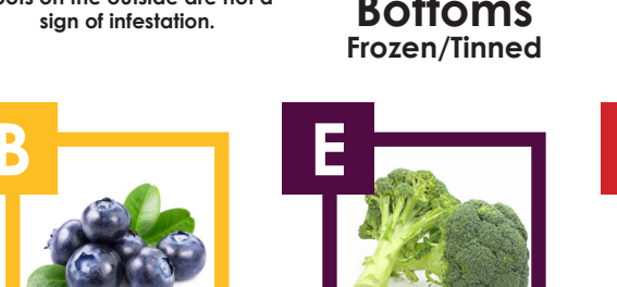
Blueberries Broccoli If extra vigilant, visually check Fresh