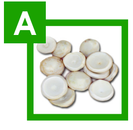
Artichoke Bottoms Frozen/Tinned